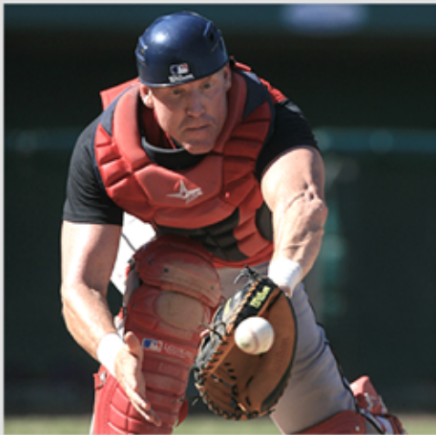
Minnesota Bandits catcher vs. Cincinnati Colt .45's on Monday

There is only one day left to sign your team up for a photo plan this week. Call Greg at 239-898-8677 ASAP