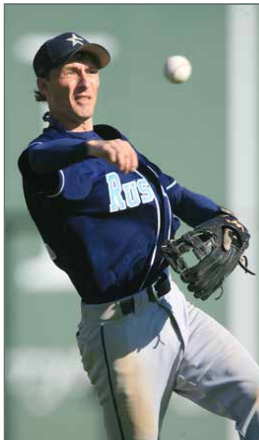
RusStar shortstop looking a lot like Nomar Garciaparra as he makes a great play vs. the Canton Tigers