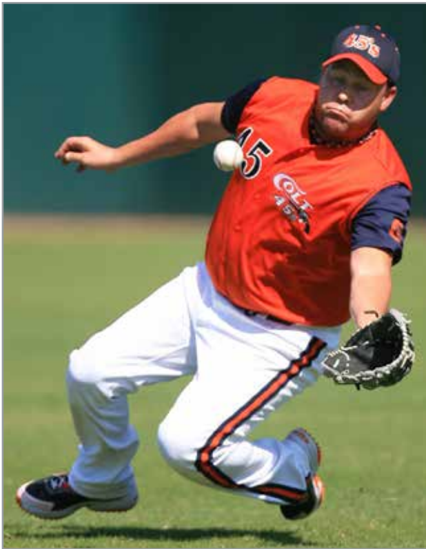
Cincinnati Colt.45's right fielder makes a sliding catch of a Minnesota Bandits fly ball.

seedings in the Open Division for its double-elimination playoffs.