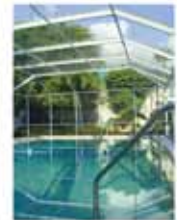
Screened-in Heated Pool!

Fully equipped, spacious condominiums with all the comforts of home featuring two bedrooms, two baths, living & dining rooms, full kitchen and large, private balconies with screened-in porches. Swim in the Gulf of Mexico or in our large screened-in heated pool. Conveniently located on the lighthouse end of the island, near a variety of restaurants and picturesque shopping villages.