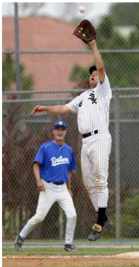
Orland Park White Sox first baseman leaps to catch a high throw vs. Tidewater Drillers.